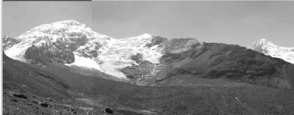
Fig 4. Mosaic based on SIFT