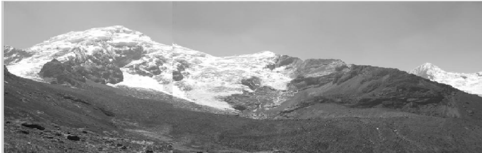
Fig 5. Mosaic based on Correlation