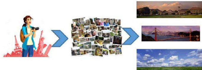
Fig 1. Panorama Creation